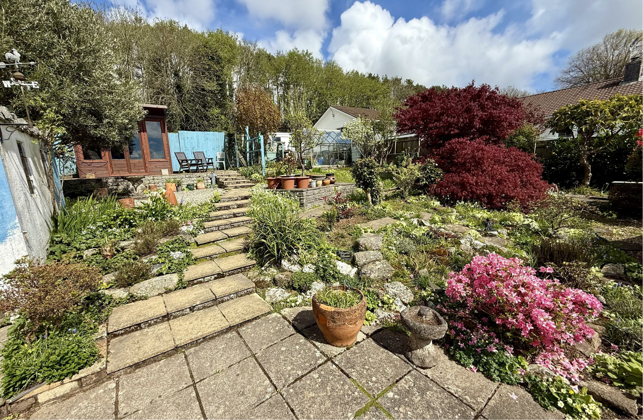
Menacuddle Lane, St. Austell, PL25 5QN